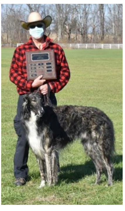
(continued on next page)