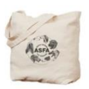
Tote Bag $15.99

https://www.cafepress.com/americansighthoundfieldassociation/8589238