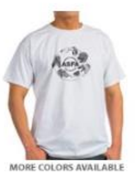
<u>Light T-Shirt</u> $19.99