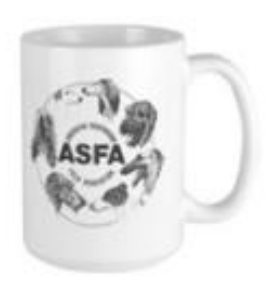
MORE COLORS AVAILABLE