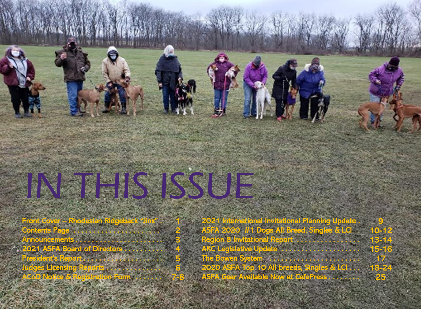
Photo: Above are the dogs (with handlers) that ran all 5 days at the 2020 Hanover PA year end trials. From Left to Right are ASFA #1 & breed #1 Jinx, #5 Ridgeback Enzo, #9 Ridgeback Vera, #17 Ridgeback Molly, #6 Saluki Adios, #7 Saluki Giggles, #2 Basenji Coco, #5 Basenji Pattie, #2 Borzoi Rhayne, #1 Pharaoh Cayper, #2 Saluki Pamina, #2 Pharaoh Bernie, #18 Pharaoh#9 Khensu, and #13 Pharoah Ohaudi, who just started her ASFA coursing career. Congratulations to all!