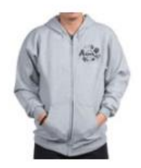
Zip Hoodie $42.99