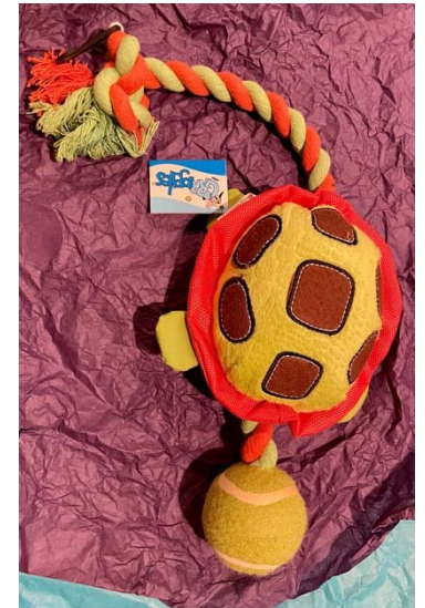
A Turtle Tug toy to LURE your Most Appreciated hound to greater victories!