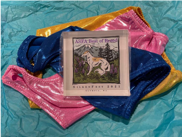
Acrylic block print Trophy plus a set of spectacular, shining lure coursing jackets for ASFA BOB

It's all gold (or yellow) for the Conformation Stakes winner!