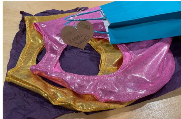
Shining yellow & pink set for when our Kennel Stakes champs happen to run as a pair

Custom SF2021 slip leads for Open, Veterans, FCh, & Singles Stakes winners!