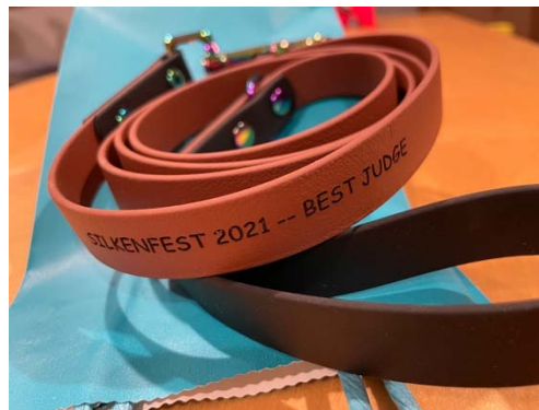
Custom Silkenfest leashes for our Judges