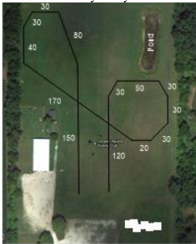
Sunday 810 yards