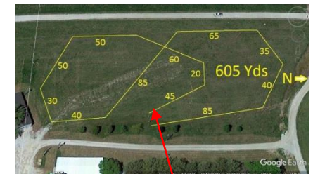
Sunday Course Plan—605 yds