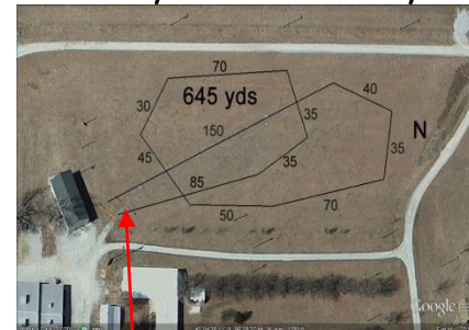
Saturday Course Plan—645 yds