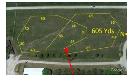
Sunday Course Plan—605 yds