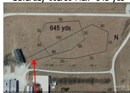
Saturday Course Plan—645 yds