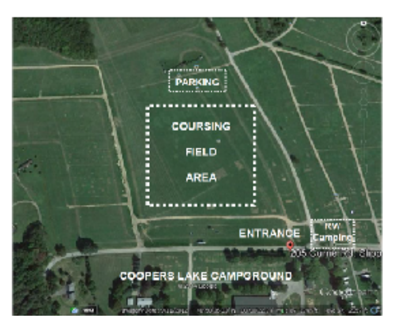
There will be yellow ASFA coursing signs from PA 422.