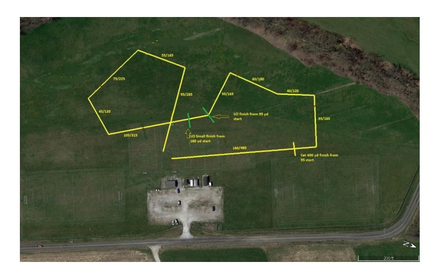
Sunday 850 yards