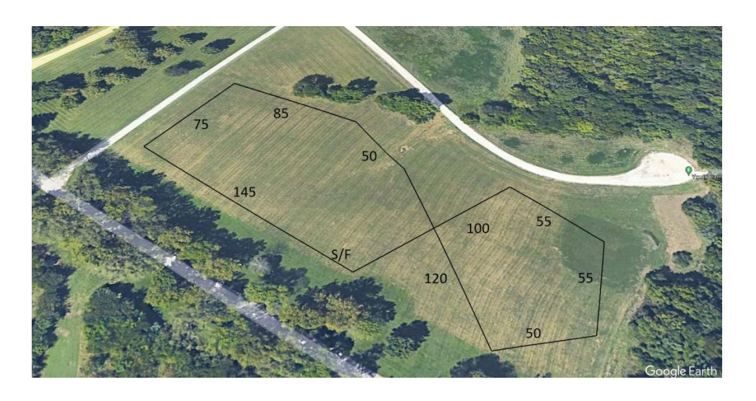
Sunday - Yards - 735 Yards