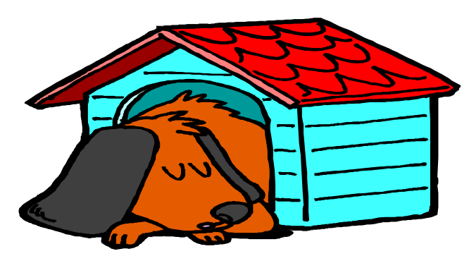
Places to rest you & your dogs...