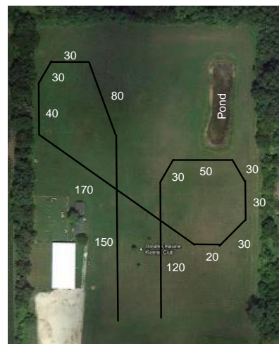
Saturday 810 yds